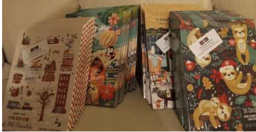
The Prime Timers gave 40 Advent calendars to the Faith Weaver Friends children.