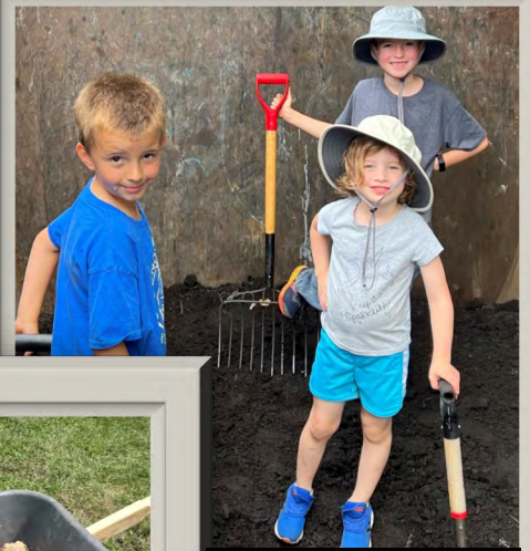
Our youngest volunteers